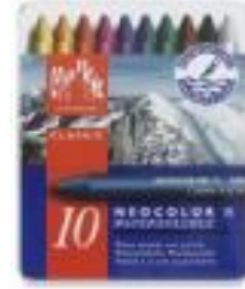
Caran d'Ache Wax Water-soluble