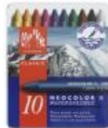
Caran d'Ache Wax Watersoluble