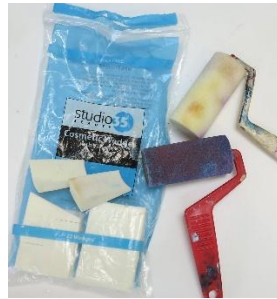
Cosmetic sponges, rollers