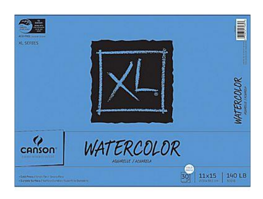
140.lb Watercolor paper, a few sheet, cut to 6 x 12