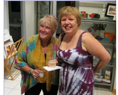
Volunteer Thank You Reception Fourth Friday September 26, 7:00–9:00 pm