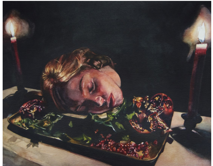
"Dedit Caput" by Ian Wallace