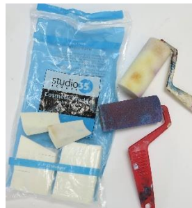
Cosmetic sponges, rollers